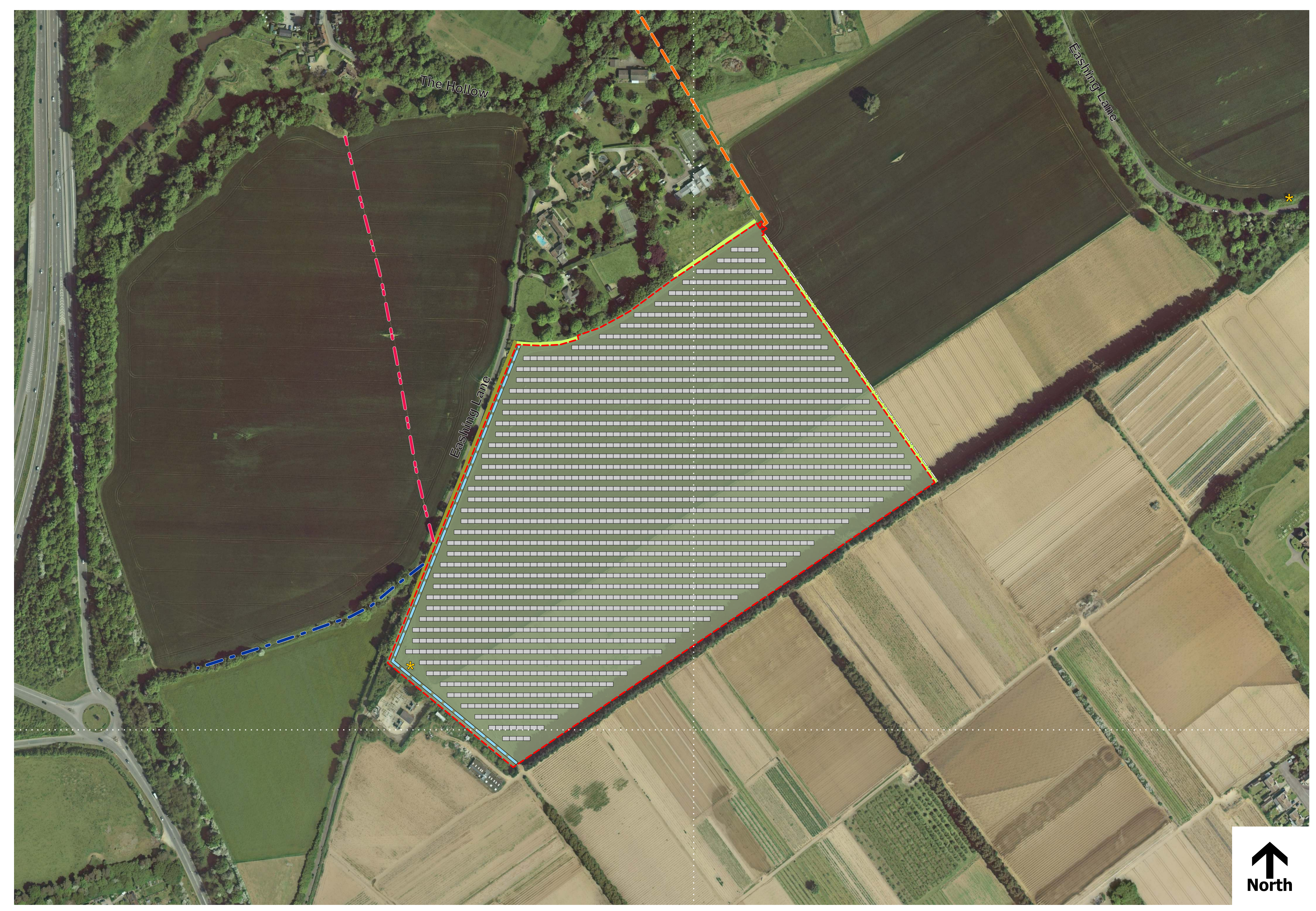
Aerial view of the surrounding context area and the proposed site. Not to Scale.